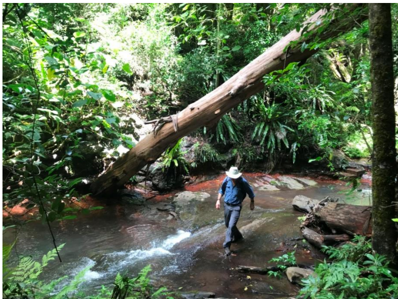
Walking in Lamington National Park