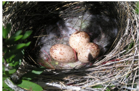
Noisy Miner Nest