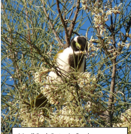
Myall Park Botanic Gardens are a drawcard for birds and bird lovers